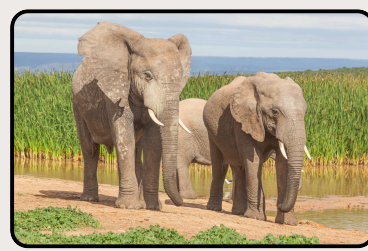
LARGE ELEPHANT POPULATION