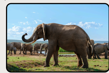
BIG FIVE SIGHTINGS

Addo Elephant National Park, located in South Africa's Eastern Cape, is a premier wildlife sanctuary renowned for its thriving population of African elephants. Spanning over 1,640 square kilometers, the park offers diverse landscapes including dense bushveld, rolling plains, and rugged hills, providing a habitat for over 600 elephants as well as a wide array of other wildlife such as lions, buffalo, and zebras. Established in 1931 to protect the last remaining elephants in the region, Addo has since grown into a significant conservation area that supports rich biodiversity and offers visitors exceptional safari experiences. Its well-maintained roads, waterholes, and guided tours ensure an immersive and educational encounter with Africa's magnificent wildlife.