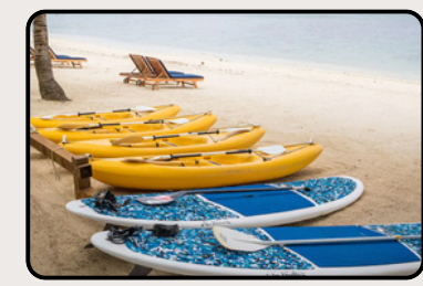
FITNESS AND FUN