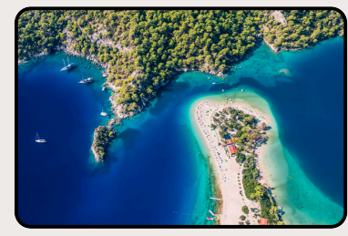
EXCAVATION AND RUINS