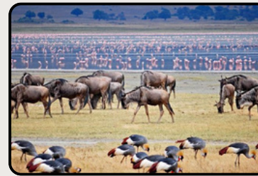
DIVERSE ECO SYSTEM