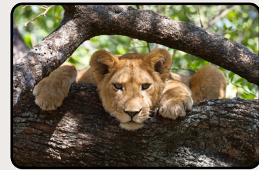
TREE CLIMBING LIONS