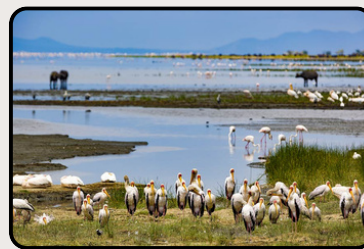
BIRD WATCHING PARADISE