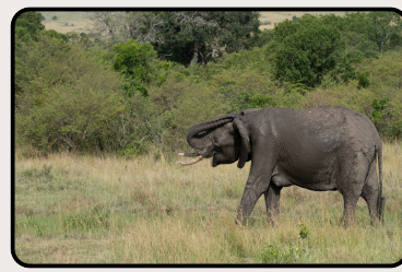
BIG FIVE SIGHTINGS