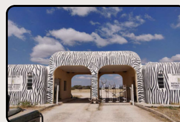
GATE WAY VIEW