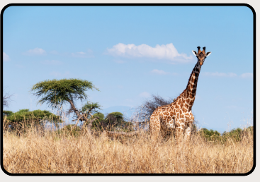
DIVERSE WILD LIFE