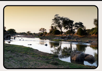
GREAT RUAHA RIVER