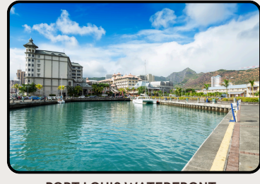
PORT LOUIS WATERFRONT