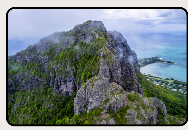
UNESCO WORLD HERITAGE SITE