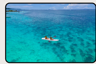
CRYSTAL CLEAR WATERS

Kayaking in Mauritius offers an enchanting journey through crystal-clear waters, where you can navigate serene lagoons, explore hidden coves, and marvel at vibrant marine life beneath the surface. Paddling through the island's stunning coastal landscapes, you'll be surrounded by lush vegetation and panoramic views of turquoise seas and pristine beaches. Whether you're gliding along the gentle waters of the Grand Baie or venturing into the tranquil mangroves of the Black River Gorges, kayaking provides an intimate and exhilarating way to experience the natural beauty and diverse ecosystems of this tropical paradise.