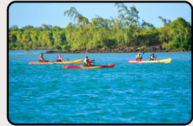
SCENIC COASTAL VIEWS