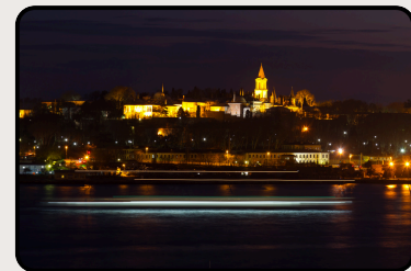
NIGHT TIME VIEW