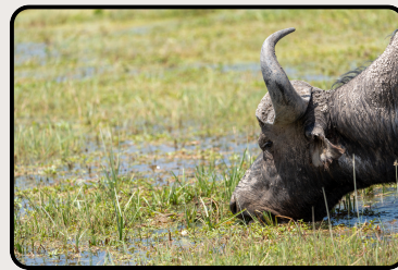
UNIQUE WILD LIFE