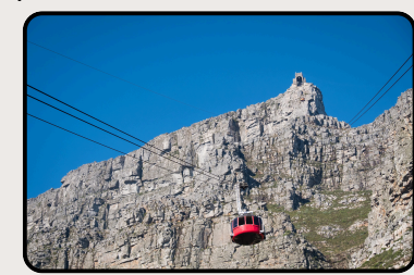
CABLE CAR RIDES

Table Mountain, an iconic landmark in Cape Town, South Africa, rises majestically with its flat-topped peak offering panoramic views of the city, coastline, and surrounding landscapes. Recognized for its stunning natural beauty, the mountain is a focal point of the Table Mountain National Park, featuring diverse flora and fauna, and serving as a prominent symbol of the region. Visitors can access the summit via the Table Mountain Aerial Cableway or embark on various scenic hiking trails that cater to all levels of adventurers. With its dramatic cliffs, sweeping vistas, and rich biodiversity, Table Mountain provides an unforgettable experience and a breathtaking backdrop to Cape Town's vibrant cityscape.