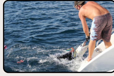
CATCH AND RELEASE