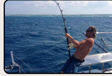
PRIME FISHING GROUNDS