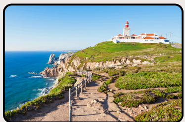
EXCAVATION AND RUINS