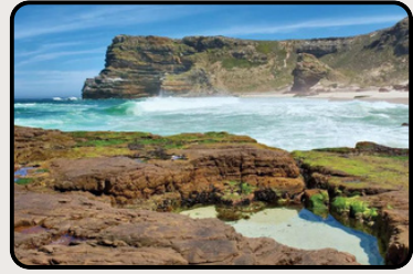
CAPE OF GOOD HOPE