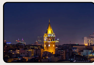
NIGHT TIME VIEW